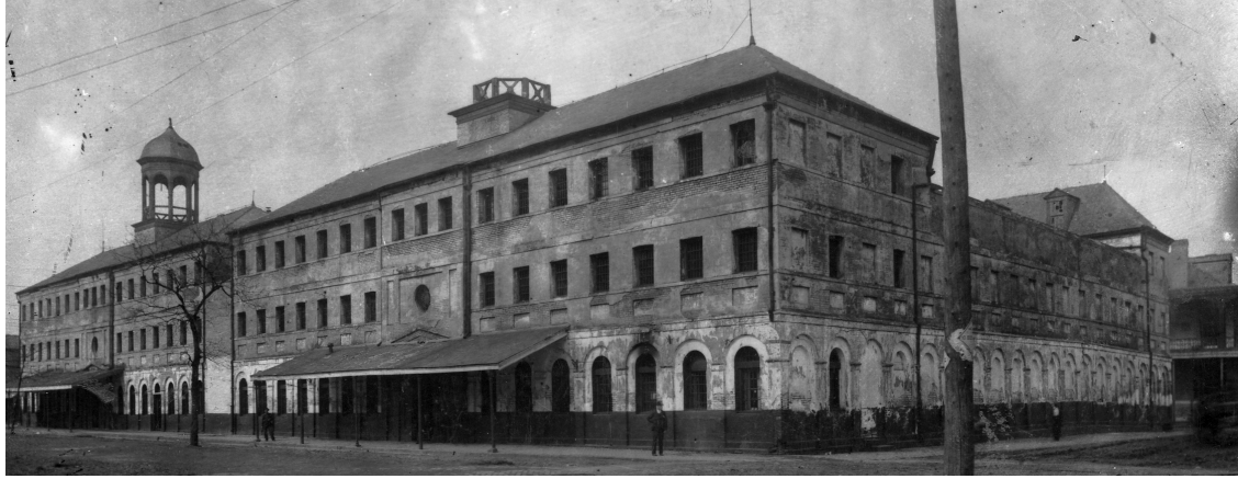
The Old Parish Prison on Orleans Street in Tremé. started in 1831, is shown here in the 1890s just prior to its demolition.

Worse, the facilities swiftly became obsolete. As the city expanded and new technologies such as radio communications and automobiles came to the task of policing, the headquarters found itself increasingly inadequate, not to mention leaky and listing. The new City Planning Commission in the 1920s, like its counterparts in the 1820s, came to feel this downtown location was inappropriate for incarceration, and employees inside wanted out. In 1931, prison and court functions were relocated to new facilities at Tulane and Broad, leaving only the precinct station in the 1893 building. Locals called it the "Old" Criminal Courts Building, despite that it was all of 40 years of age.